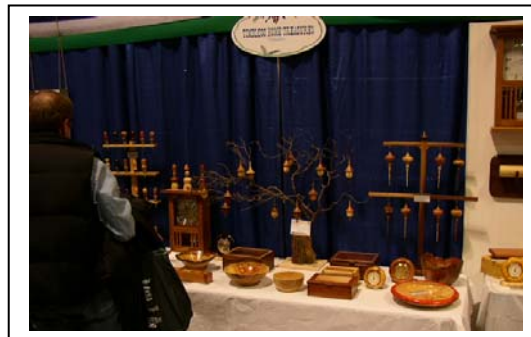
More of Duey's booth