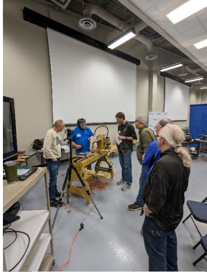
Spring Symposium 2024 (cont)