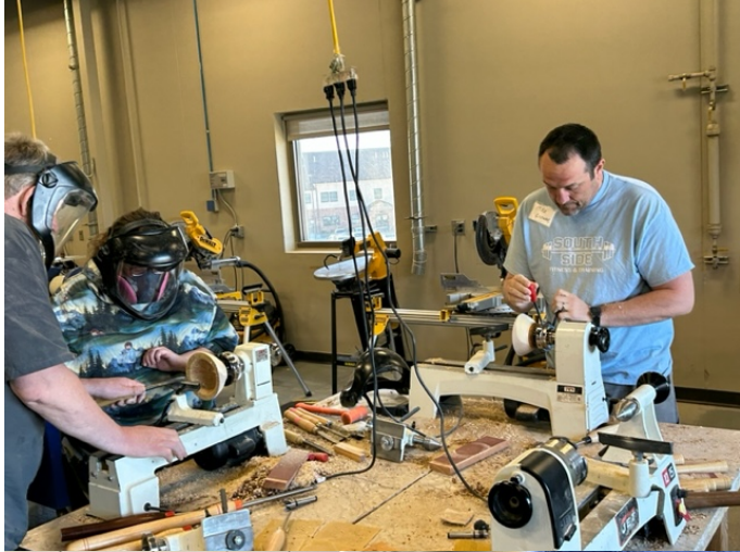
Spring Symposium 2024 (cont)