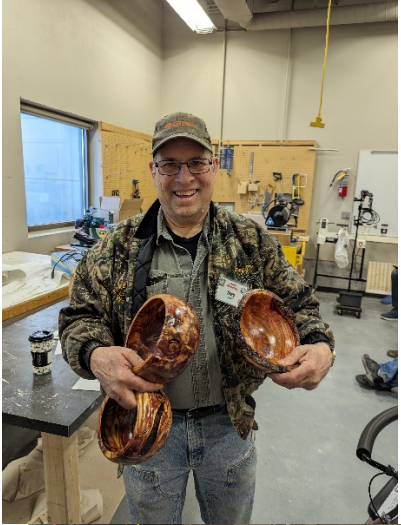
Spring Symposium 2024