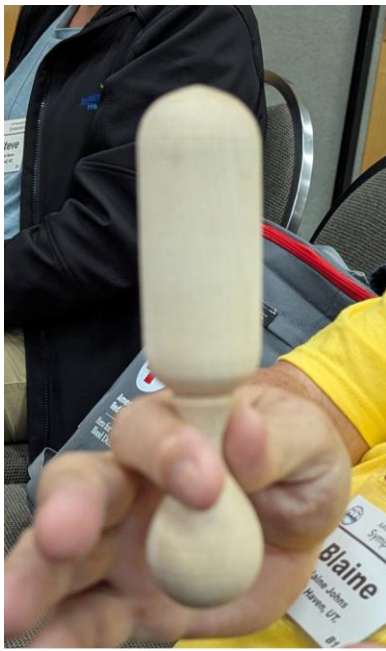
Security Escorts Rowdy Woodturner Out at AAW: