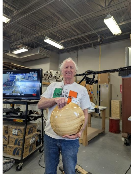
April 12 Mtg Show and Share: