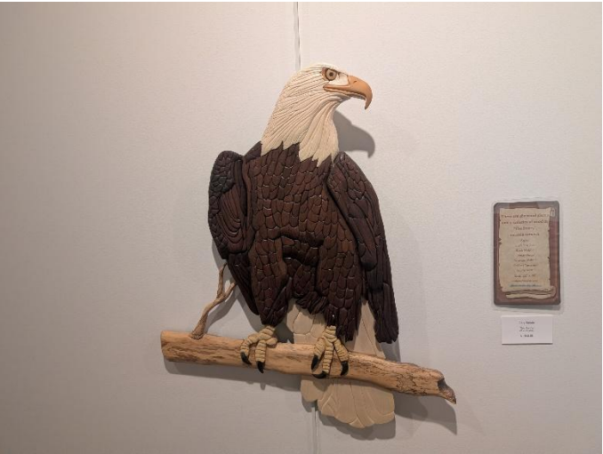
Gary Stende Wood Art Examples: