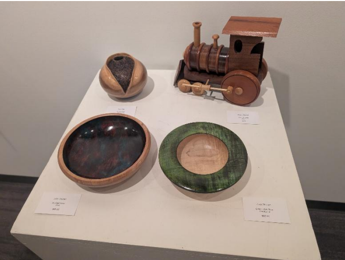
DWT Items shown at BAGA Dec 2025: