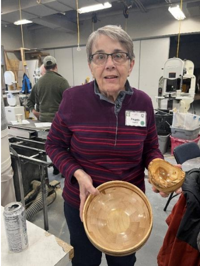
Show and Share December 13: